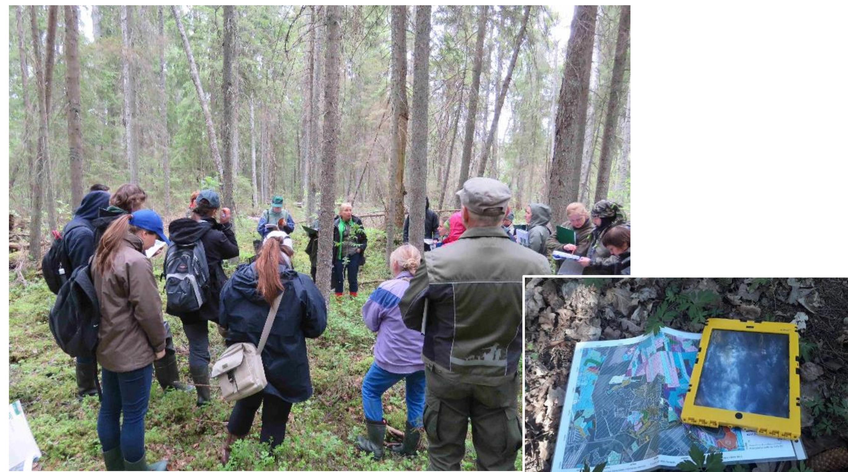
Training and calibration on data sheet entry.

Mapping of forest habitats of European importance in Latvia (EU boreal biogeographical region) was conducted in 2017–2021, with the aim to determine their distribution and quality. A total of 274 experts participated in field survey, all of whom participated in training and calibration sessions. Experts were given maps with obligate areas to survey (identified from the forest register and other sources). In the field, identified forest habitats were mapped and information on structures, processes and species were entered on the standardised data forms. The area of mapped forest habitats was about 33,000 ha (9% of total forest area). Only 30% of this area is in the Natura 2000 network and only 4% of the total forest area in Latvia is strictly protected. Therefore, there is great need for improving conservation strategies, based on quality parameters of the habitats. Algorithms are being developed to assess quality of the mapped forest habitats, with the aim identify those for protection.